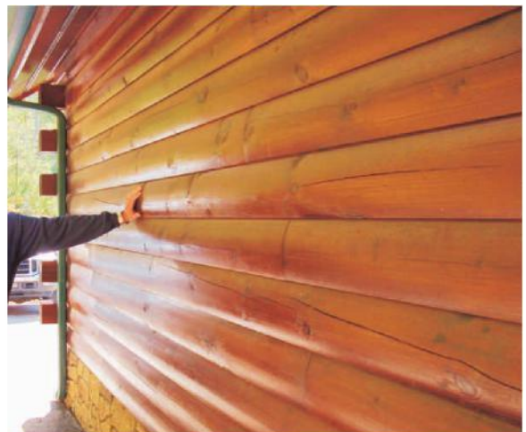
The same wall 6 years and 11 months later. No maintenance had been performed on the exterior finish during the intervening years.