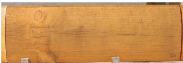
Two color coats, no topcoat