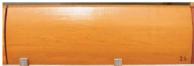
Two color coats of the same color, plus Advance Gloss Topcoat