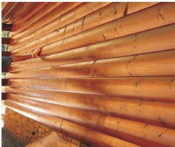
One of the first homes topcoated with Advance Gloss.

These are some of the reasons why LIFELINE™ Advance Topcoats play a key role in the performance of all of our exterior finish systems.