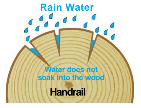
Finish film on wood surface and in fissures.

So, what do we suggest to assure adhesion of a finish to new handrails? The first thing is to wait until the handrails have reached a moisture content of less than 20% before doing anything. This may take two months or six months depending on how green they are and the diameter of the rails. By then most of the cracks and fissures will have opened up and any remaining cambium will have dried up and peeled off. The problem with this is that some people moving into a new home are not willing to wait to finish their handrails. If that's the case, the best course of action is to sand the handrails with 60 to 80 grit sandpaper as best you can, wash them down with Log Wash™, let them dry and then apply only one coat of any VISTA™ Deck. DO NOT APPLY ADVANCE™ TOPCOAT TO AREAS COATED WITH