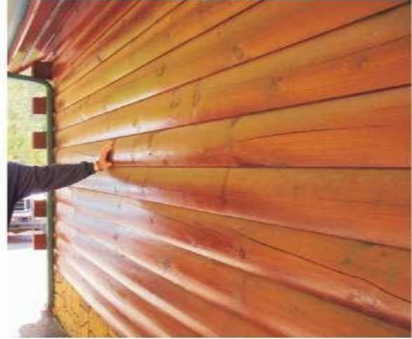
The same wall 6 years and 11 months later. No maintenance had been performed on the exterior finish during the intervening years.