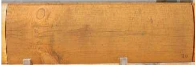
Two color coats, no topcoat