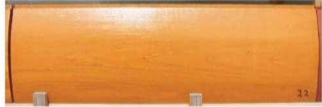
Two color coats of the same color, plus Advance Gloss Topcoat

Another beneficial feature of a clear topcoat is the physical barrier over the pigmented stain. A topcoat prevents airborne contaminants (i.e. sulfur dioxide, ozone and particulates) and natural contaminants (i.e. tree pollen and bird droppings) from contacting the pigmented stain. These contaminants can damage or discolor the stain by chemical reactions or supporting mold growth.