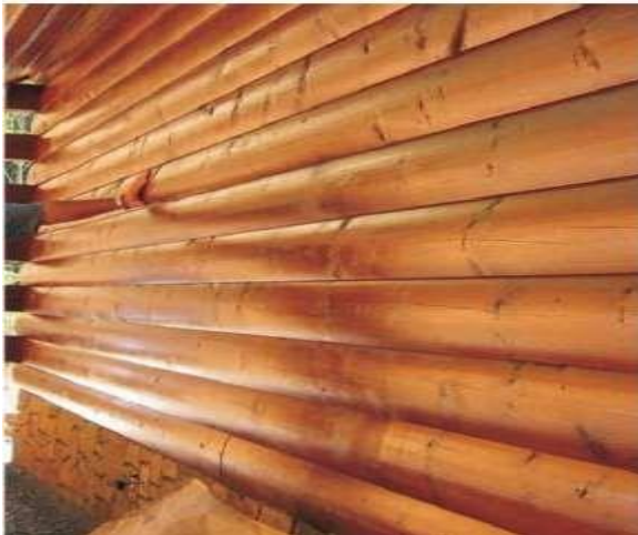
One of the first homes top-coated with Advance Gloss.

These are a few of the reasons why LIFELINE™ Advance Topcoats make our finishes among the most beautiful log home finishes in the world.