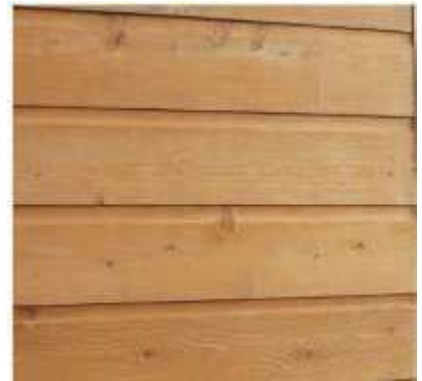
Wall with cosmetic chink joints

For cosmetic chink joints that are 3/8 inches deep or deeper Perma-Chink may be used but you should be aware that Chink Paint is a less expensive alternative that's much easier to apply. If the joint is deep enough to accommodate both backing material and the proper thickness of Perma-Chink it's best to actually chink it to prevent water from accumulating on top of the bottom lip.