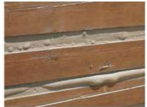
Blisters in thin layer of chinking applied over bare wood