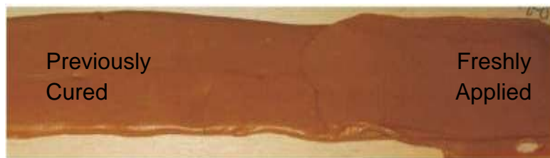
After Drying Until 2:00 PM