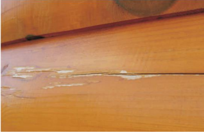
Peeling issue around fissures that formed on surface after application of the finish.

Two additional factors play a role in the susceptibility of a finish to peeling. The first is vapor permeability. The more permeable a finish, the less likely it will peel. However even vapor permeable finishes like Lifeline can peel when applied too thick, too many coats applied or the amount of vapor overwhelms the permeability. That is why we recommend thin coats initially and for maintenance coats. It is much more important to keep the surface clean than it is to apply an additional coat of topcoat every two to three years. Every coat that is applied will reduce the vapor permeability, eventually to the point where water vapor can no longer permeate through the film. As the vapor transmission decreases, the risk of vapor causing delamination increases.