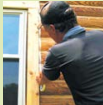
Apply masking tape to prevent sealant from smearing onto the adjacent logs