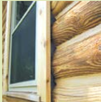
Insert Log Gap Cap™ into void between logs and frame. Leave 3/8" gap between surface of foam and edge of frame