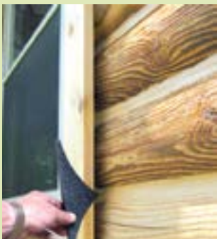
Use Log Gap Cap™ where round logs meet window and door jamb trim