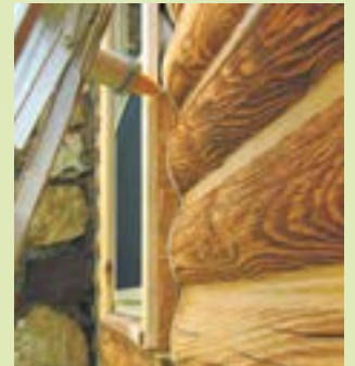
Fill the 3/8" gap between the surface of the foam and the edge of the frame with sealant